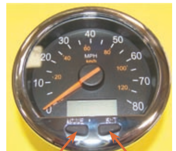
Mode Switch Set Switch Figure 3 – ICUF Speedometer Switches

To test for this condition on gauges that display information sent from the engine, connect the service tool used to read the engine information, or connect Servicelink to the truck’s diagnostic connector. Check to see if the engine ECU is broadcasting the information for the gauge. If it is not, the problem is in the engine sensor, engine harness, or engine ECU. If the information for the gauge you are testing is being broadcast, but the gauge is not displaying it the problem is with the speedometer.